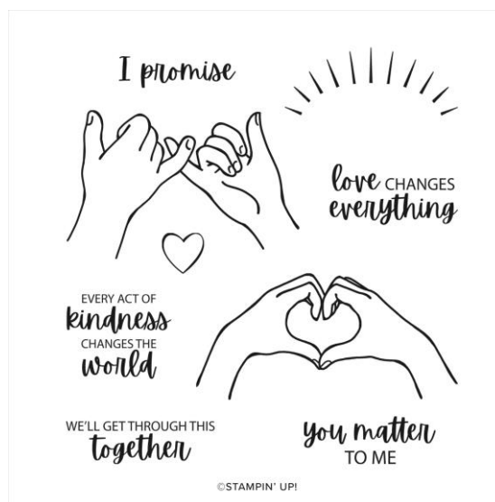
Here Together Stamp Set #158634